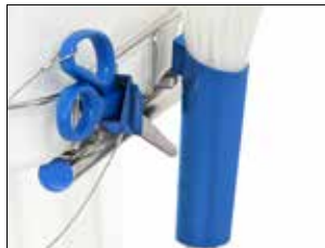
Cable-tie holder for Longopac Stand Dynamic Item no. 30410 (only holder) The cable-tie holder for the Dynamic range is suitable for Mini, Midi and Maxi Dynamic.