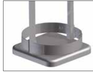
Frame for Longopac Stand Classic Maxi Item no. 33900 The frame holds the bag in place.