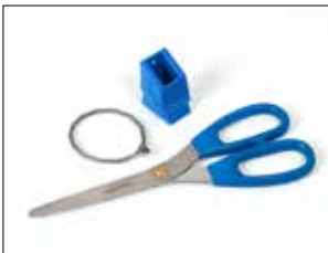
Scissors kit for Longopac Stand Dynamic, metal-detectable Item no. 34609 Kit containing metal-detectable scissors, scissors holder, stainless steel wire.