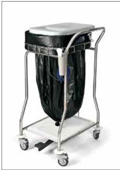
Stand Midi Nouvo Pedal