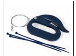
Safety kit Cutter blue kit Item no. 30440 Contains cutter, metal de-detectable PP. Wire in stainless steel and cable ties, metal detectable PA