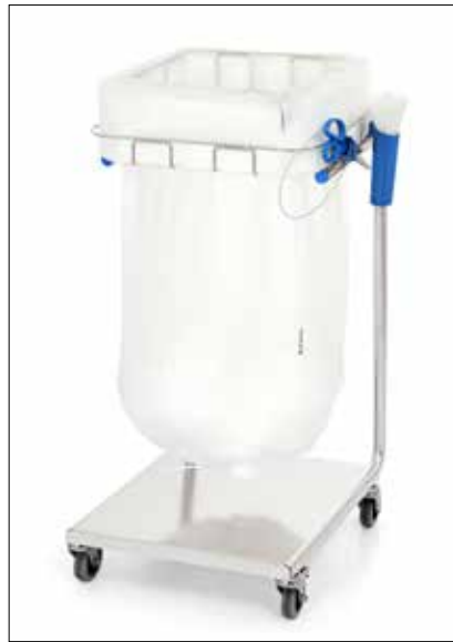
Stand Dynamic Midi/Midi Pedal