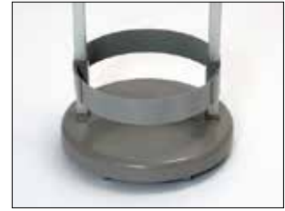
Frame for Longopac Stand Classic Mini Item no. 33890 The frame holds the bag in place.