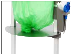
Adjustable plate for Stand Classic Mini Item no. 31480 Reduces the consumption of bag material and reduces the size of the bag. Primarily intended for use with sticky, heavy waste. Can be used for Bio bag cassettes.