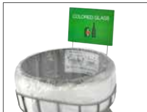
Sign holder for Longopac Stand Classic & Dynamic For item no. see charts on Stands and Dynamic. Signs are available in A4Portrait or A5Landscape.