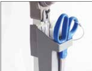
Cable-tie holder for Longopac Stand Classic Std grey. Item no. 30410 Metal-detectable, blue. Item no. 30416 The cable-tie holder is suitable for both Maxi and Mini, and available in two versions.