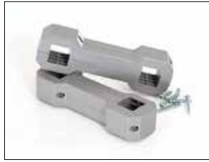
Connector for Longopac Stand Classic Item no. 33750 Connects two or more Longopac Stand products simply and securely. It is also possible to connect Maxi to Mini.