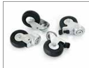
Stand Dynamic ESD Kit Wheels Item no. 34616 Contains four castor wheels, two of them with brakes. Replaces the original wheels on stands used in ESD restricted areas.