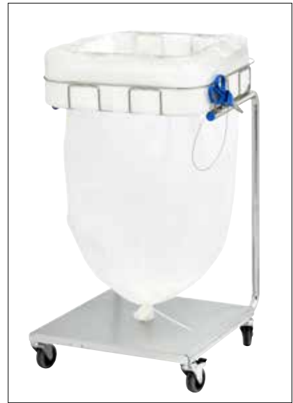
Stand Dynamic Maxi/Maxi Pedal