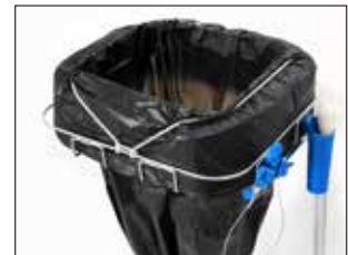
Rubber band Item no. 3102 This accessory can be used together with all Longopac cassette holders. Effectively locks the cassette in place and prevents it from unravelling.