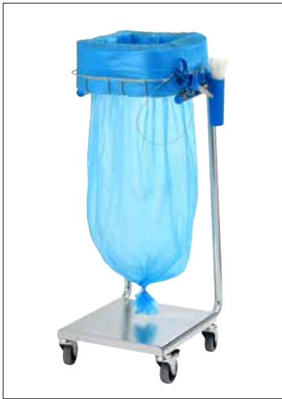
Stand Dynamic Mini/Mini Pedal