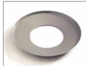
Adapter disc for Longopac Stand Classic Maxi Item no. 30170 Reduces the aperture for easier compression of e.g. recycled plastic. Only available for Maxi.